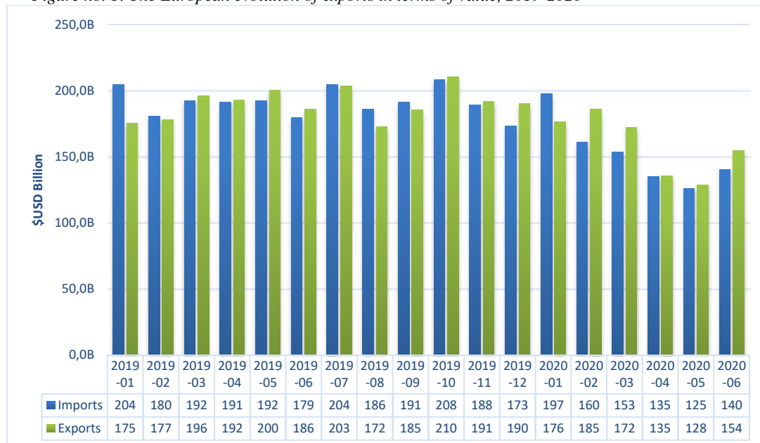
Figure no. 1: The European evolution of exports in terms of value, 2019-2020*

**Excluding data for July, September, October, November and December 2020 – data is not available for 2020