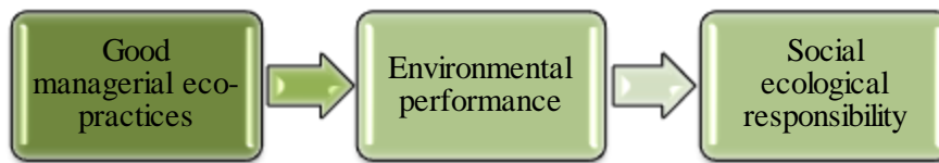
Figure no. 1. Conceptual model

The aim of this study is to analyse the relationship that exists between good eco-managerial practices, environmental performance and social responsibility. Consequently, we have developed the following conceptual model presented in Figure 1.