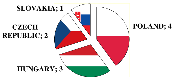
Figure no. 1. The geographical distribution of the ten largest companies from the Central and Eastern Europe in 2015

Poland is dominating the rank, with four companies amongst the top 10, followed by Hungary (with 3), the Czech Republic (2) and Slovakia (1) (figure no.1).