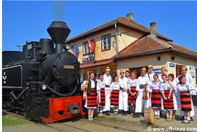
Figure no. 4. Local people wearing traditional costumes

Nature tells its story along the narrow railroad that, alongside the dances and the popular costumes worn and presented by the locals at the final station, reflects just one of the ways to exemplify the principle which states ecotourism contributes to a better understanding of the local nature and traditions and ensures visitors and locals joy and pleasure.