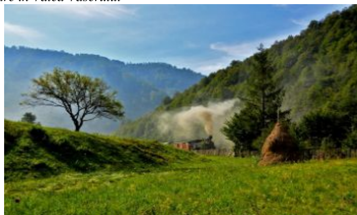
Figure no. 3. Nature in Valea Vaserului

Another principle of ecotourism is that it unfolds within nature and is based on the tourists' direct and personal experience with nature both while on the steam train and during the stops it makes.