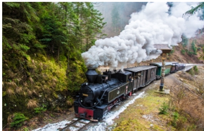
Figure no. 1 The Steam Train

Starting from these definitions and together with the observations made in Valea Vaserului, we can say that tourism in that region takes place respecting the above definitions and also the principles of ecotourism.