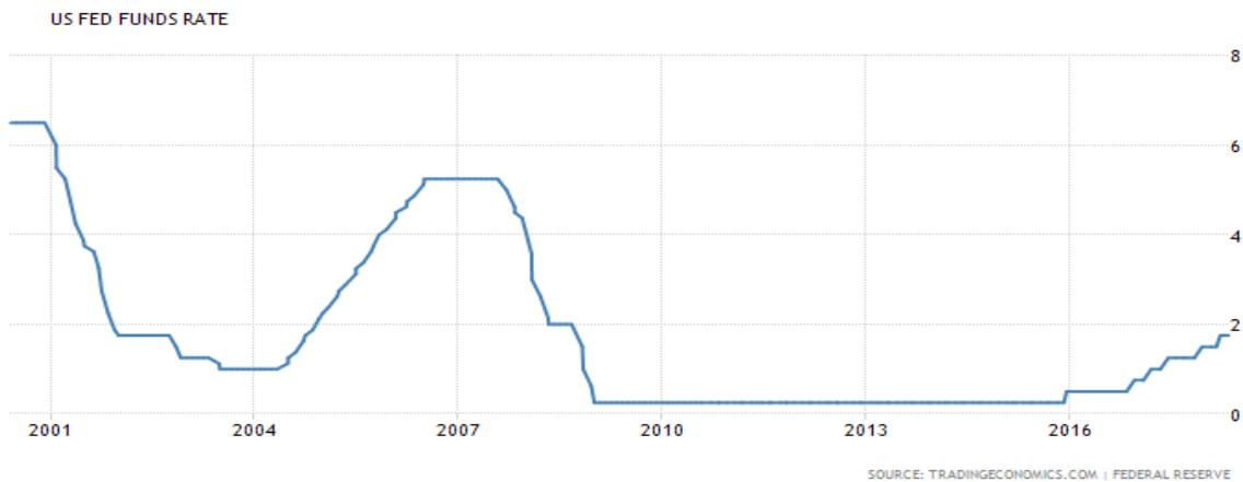
Figure no.1. US FED Funds Rate