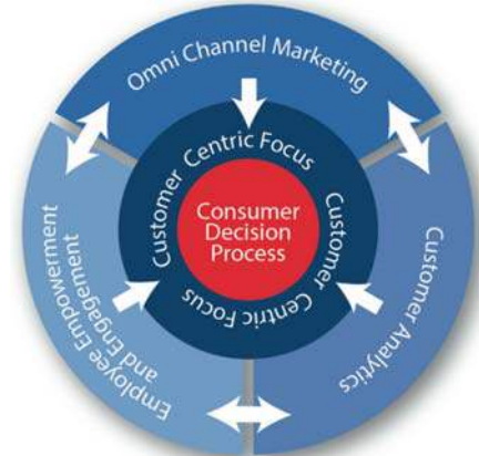
Figure no. 2. Key areas for achieving sustainable competitive advantage in the mobile shopping era

Another critical area of exploration is the impact of mobile apps on the consumer decision-making process. Traditional decision models are being reshaped by the immediacy and convenience offered by mobile platforms. Mobile apps influence each stage of the consumer journey—from pre-purchase research facilitated by review aggregators to real-time purchase incentives like flash sales. The role of post-purchase engagement is equally significant, with apps providing support and fostering loyalty.