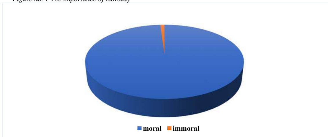
Figure no. 1 The importance of morality

As far as morality is concerned, 99% of the people interviewed consider that the issue of immorality is very important, because it is appreciated that compliance with ethical rules increases trust in the public administration (Figure 1).