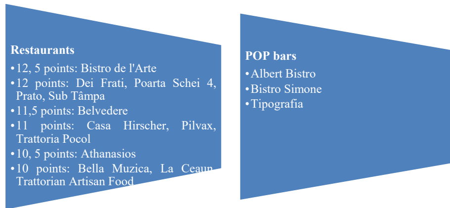
Figure no. 2. Restaurants and POP bars from Braşov city included in the Gault & Millau guide