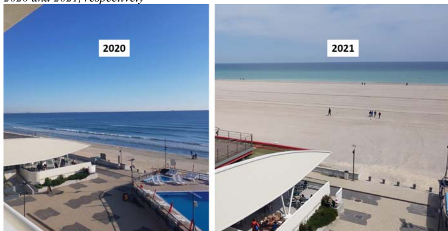
Figure no. 3. Comparative images of the width of the beaches located in the center of Mamaia resort, in 2020 and 2021, respectively

Another justified tourists’ dissatisfaction is the fact that the sand on the beach is less fine than the one that existed until this year, being covered with many shells, in which they may cut the soles of their feet at any time, when stepping on the beach (Figure No. 4).