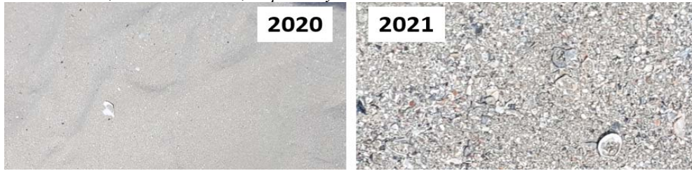
Figure No. 4. Comparative images of the rough quality of the sand of the beaches located in the center of Mamaia resort, in 2020 and 2021, respectively