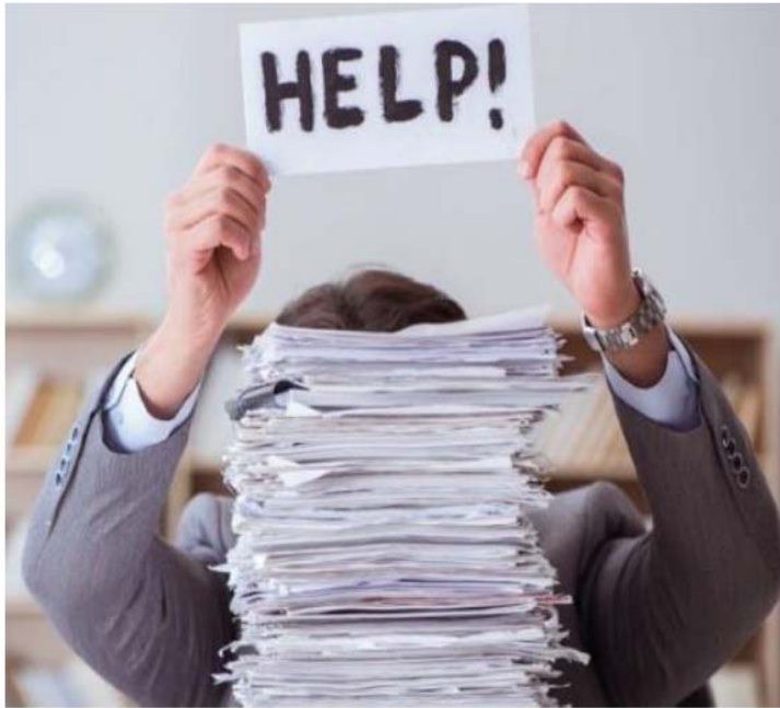
Figure no. 1 The accounting specialist behind a pile of papers

Although it is not recognized by the great masterpieces made in sculpture, painting, literary works, film, theater or music, accounting requires skill and refinement, it means continuity, attitude, optimism, theory and practice. If for speaking a foreign language you need a correct pronunciation and knowledge of vocabulary, for practicing accounting you need knowledge in all areas of activity and a lot of dedication. He who does not penetrate his secrets cannot hold "reckonings", although we all do this! But how do we do it?...and how much trouble do we give others to manage?!