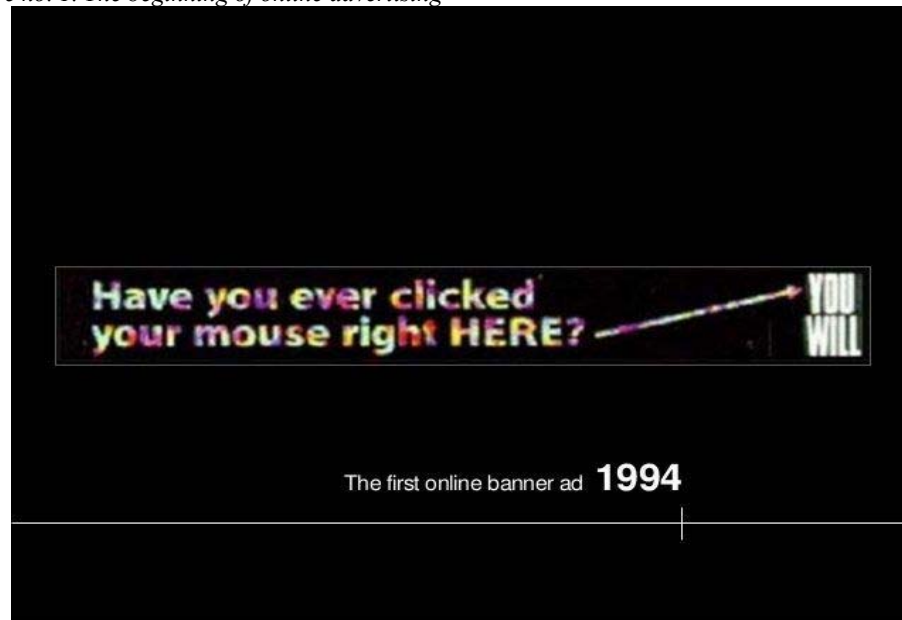
Figure no. 1. The beginning of online advertising