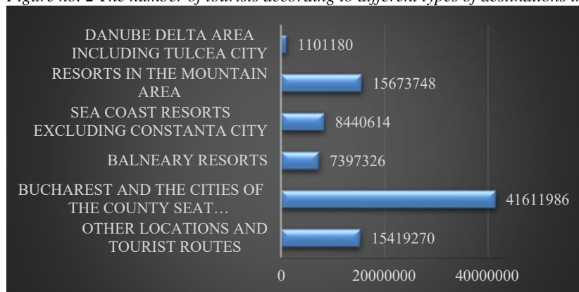
Figure no. 2 The number of tourists according to different types of destinations in Romania