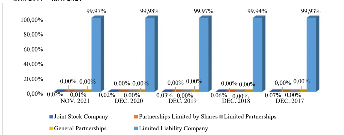
Figure no. 2 Registered companies in Romania in the South-East Economic Development Region between dec. 2017 – nov. 2021