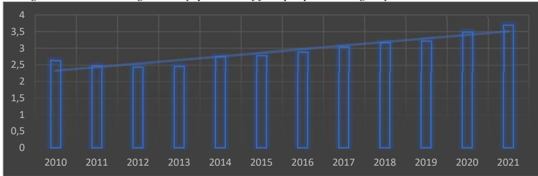
Figure no. 2 The average monthly quantities of fruit per person bought by a household