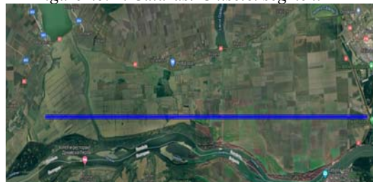
Figure no. 2. Calarasi-Chiselet segment