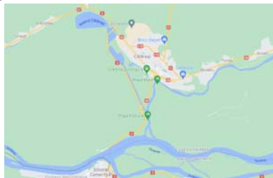
Figure no. 1. Călărași canal and industrial port