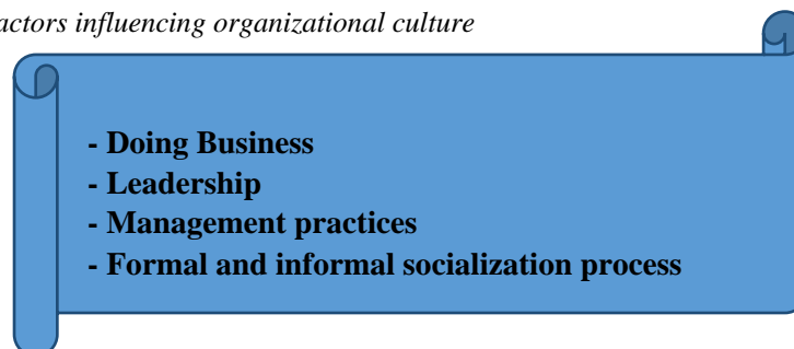
Figure no. 2. Factors influencing organizational culture

Factors that can influence organizational culture are business, leadership, management practices and the social, formal and informal factors to be considered in any analysis, especially when it is necessary to change the organization. (figure no.2).