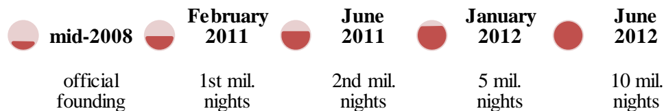
Figure no. 2. Airbnb's evolution between 2008 and 2012, worldwide