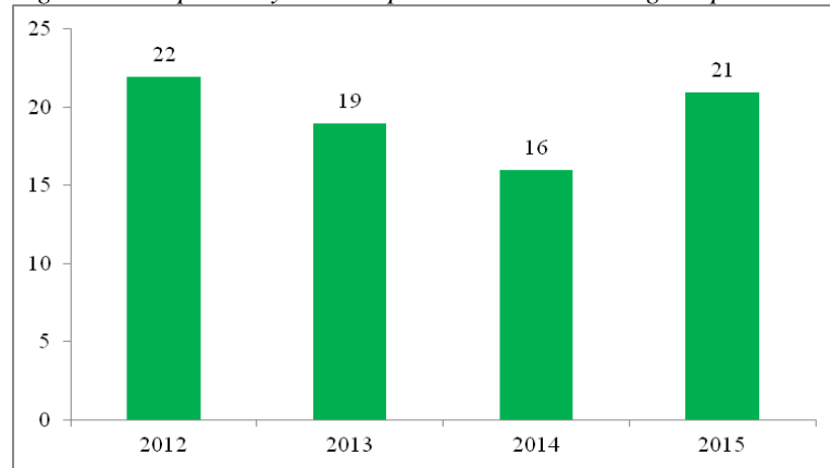
Figure no. 2 Investigations completed by the Competition Council during the period 2012-2015

Source: Competition Council, 2016, p. 10