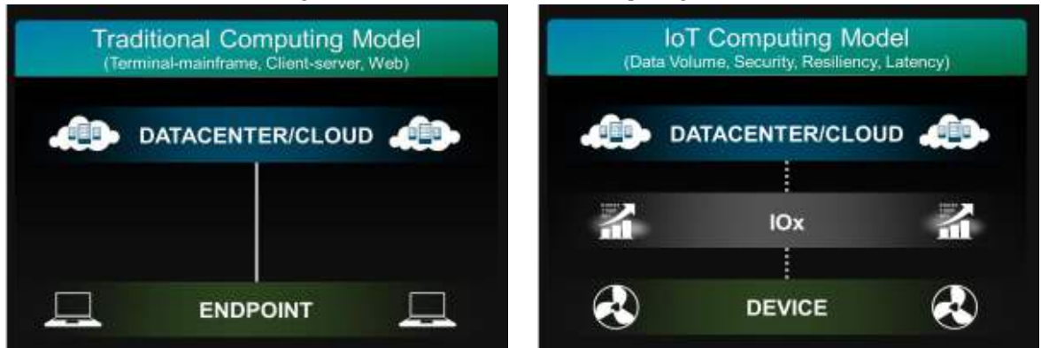
Figure no. 2. Traditional vs IoT Computing Models

A seamless application enablement framework and compute platform across various devices operating at the network edge are provided by the IOx, having the ability to host applications and services, connecting them in a secure and reliable way to applications in the cloud. The term Application enablement covers all life cycle aspects of applications including development, distribution, deployment, hosting, monitoring and management. Traditional Computing Model versus IoT Computing Model based IOx platform are presented in figure no. 2.