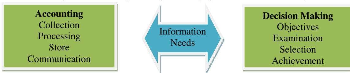
Figure 1. Role and importance of accounting information in decision making

To summarize the above mentioned approaches and to acknowledge the role and importance of accounting information in decision making, we shall represent them in Figure 1.